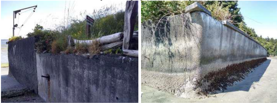
Shoreline armoring at Seahorse Siesta